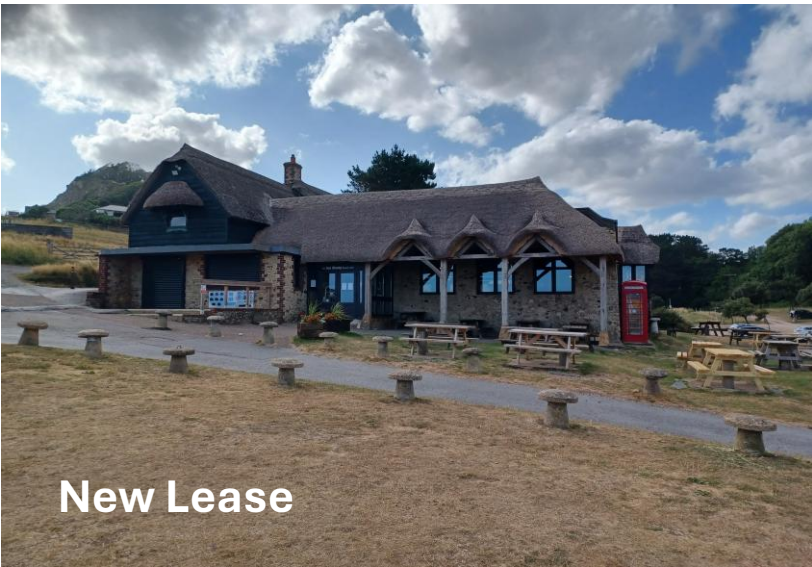
Sea Shanty, Branscombe Smart lock up beachside licenced café, takeaway and shop. New tenancy available 3-5 years. Base rent £55,000 pax.