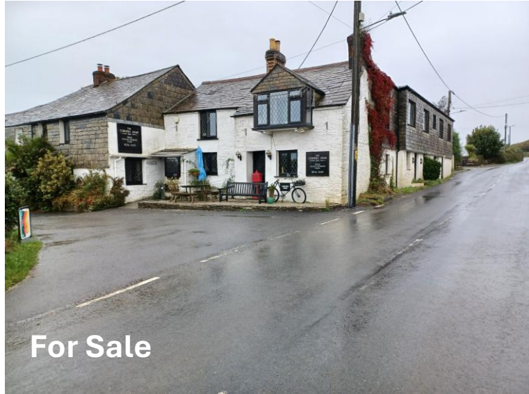
Cornish Arms Inn, Pendoggett - £475,000 Freehold Roadside public house close to Port Isaac and Polzeath. Public bar and restaurant, 7 letting bedrooms, beer garden and parking.