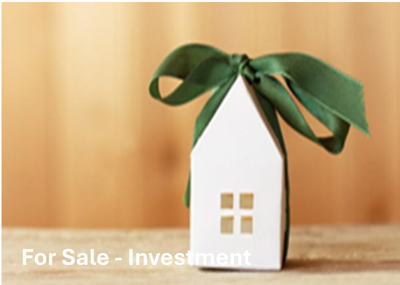
Freehold freehouse held under lease terms Successful business with tenant in situ.