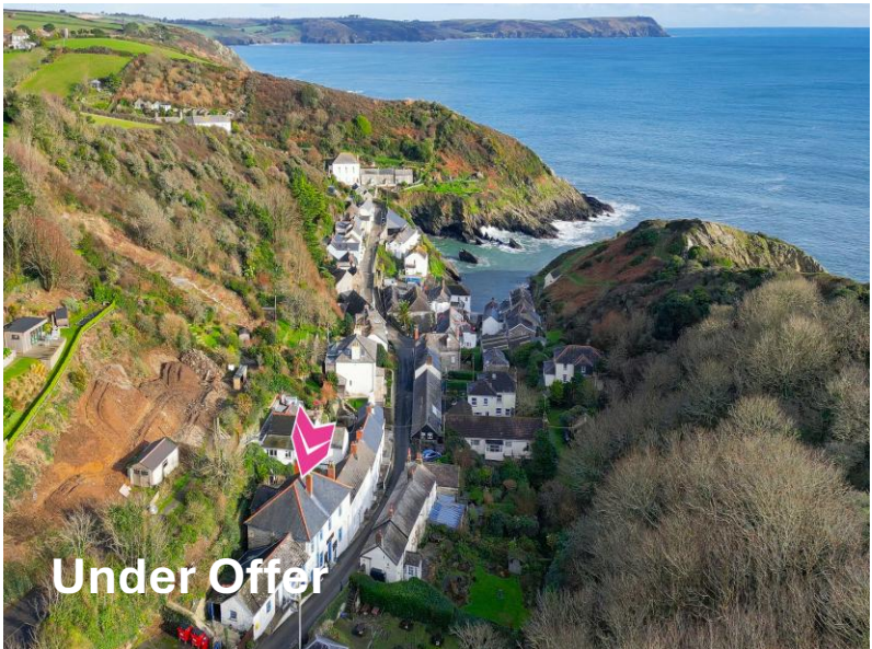
The Ship Inn, Portloe – Guide price £550,000 Freehold Village pub in coastal location. Public bar and restaurant. Attractive beer garden and customer parking.