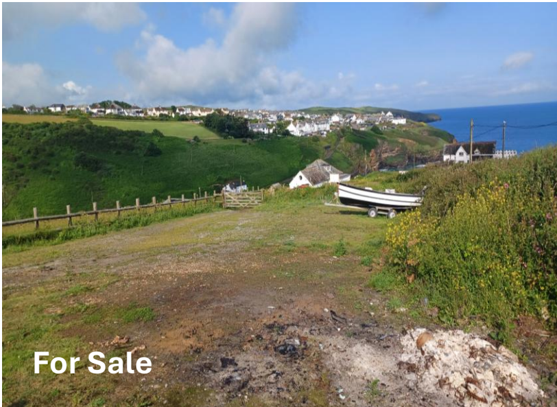
Land at Port Gaverne Guide £80,000 plus VAT Close to coast with outstanding views. Open storage / car parking. Rare opportunity.