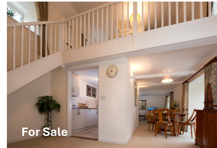
Holiday Cottage within Kenegie Holiday Park, Gulval - £200,000 Rare opportunity for a 2-bed property with ground floor open plan living. Freehold.