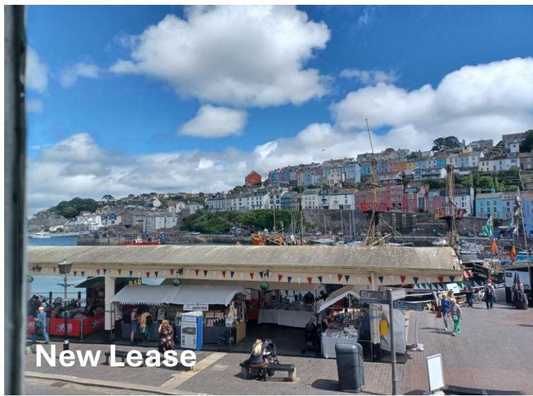
Rising Sun, Brixham – Nil Premium / rent £27.5k pa New 20-year lease available. Free of tie. Ground floor bar. Accommodation over two floors.