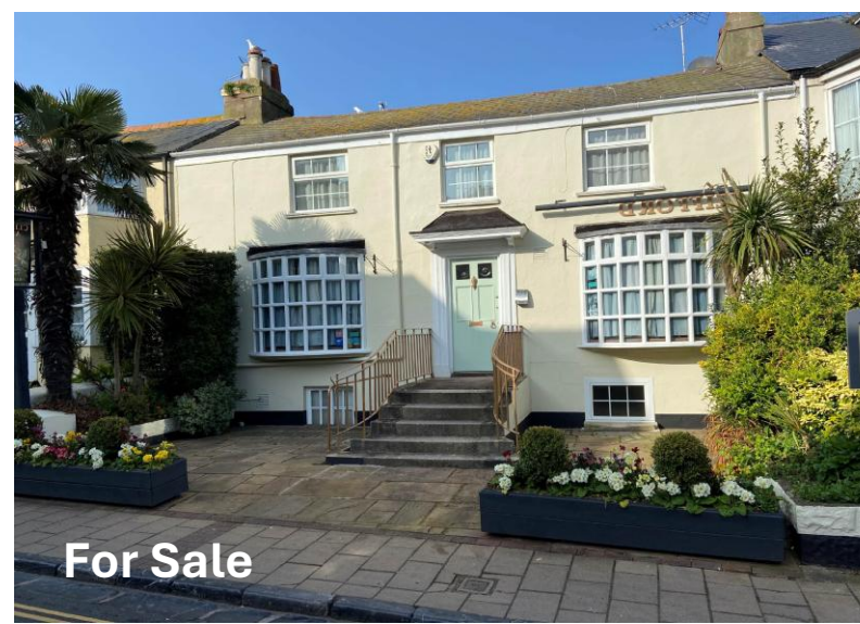
The Clifford Arms, Shaldon – Excess £550,000 Attractive bar and restaurant with two bedroom accommodation. Beer garden front and rear.