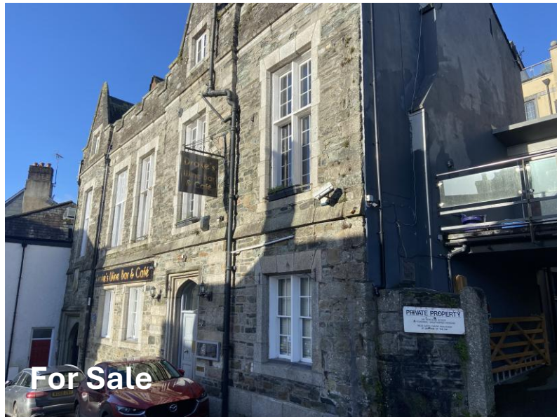
Ordulph Arms, Tavistock – Guide price £250,000 Grade II Listed building with second floor living accommodation. Popular moorland town – requires investment.