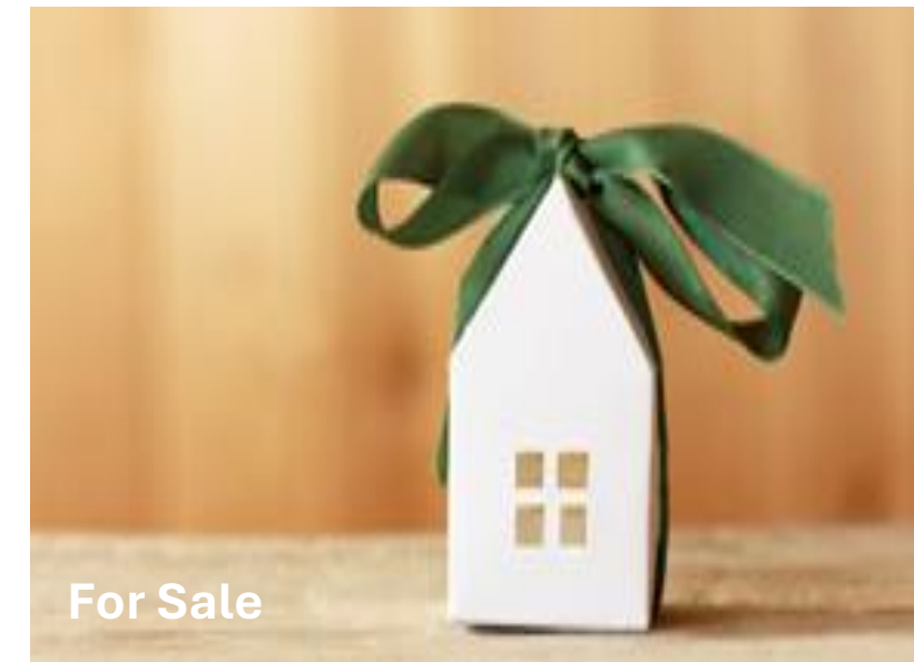
Confidential Going Concern Sale – Guide £425,000 City suburb freehouse. Trades from restricted sessions and wet sales only. 0.23 acre site and may suit development (STP).