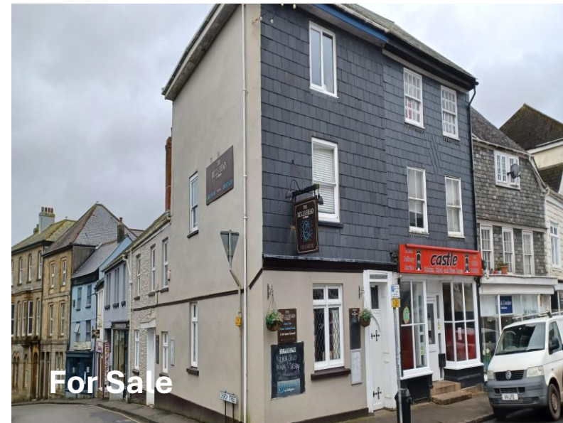
Bulls Head, Callington - £475,000 Freehold & Business Successful town centre Inn. Historic pub interior with lots of character. 2 bed and 1 bed owner's accommodation.